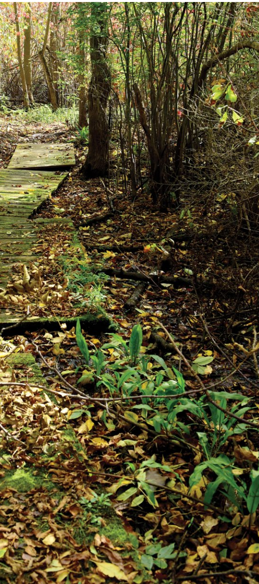
Nigel P. Kent

Annual trail mulching isn't enough anymore. Across the preserve, increased flooding from Lake Ontario floats old boardwalks out of place and creates new muddy spots.