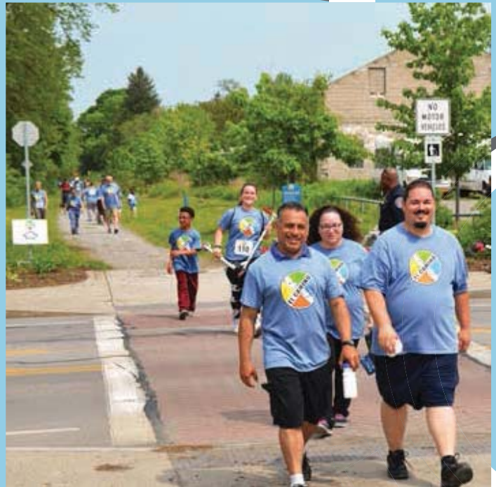
On National Trails Day for the past six years, Rochesterians of all ages turn out for the 5K Walk @ El Camino.