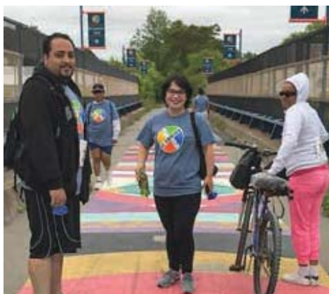
A faux carpet on a foot bridge, painted by local artists as part of a Wall/Therapy project.