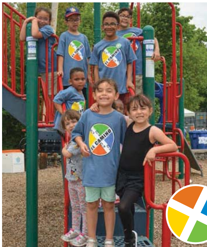
Kids now have a place to play—local children enjoy the state-of-the-art playground maintained by the city and residents.

In 2010, the partners achieved a third milestone when they built a state-of-the-art playground. They worked with IADC’s newly-formed Project HOPE to build a playground surfaced with mulch, planted with bulbs and native flowering trees, and framed by hardscape benches, aided by grants from the Greater Rochester Health Foundation and Rochester Garden Club. GLT and IADC help the City and residents to maintain the playground, a place where local kids can enjoy the outdoors in a safe environment.