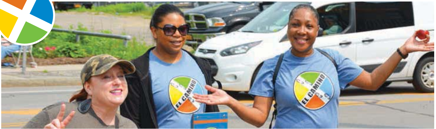
The multi-use trail inspires everyone: kids peddle in trike and bike clubs; families hike; and seniors stroll.